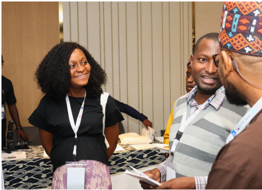
SfM representative discussing with other conference attendees

In addition to their presentation, the team participated in various technical sessions, including a panel 'Supply Chain Beyond the Clinic.' This panel featured representatives from different countries, who shared strategies their countries have adopted to ensure equitable access to essential commodities. The team also connected with peers who shared similar interests, building relationships for future collaboration, while attending oral and poster presentations by other participants.