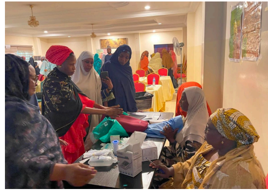
OSCE demonstration at Kano State training of trainers