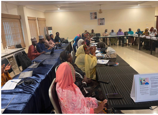
Participants at the Kano State training of trainers