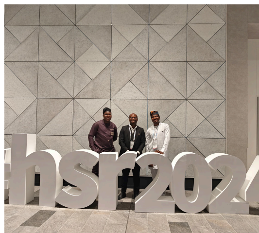
SfM representatives at HSR