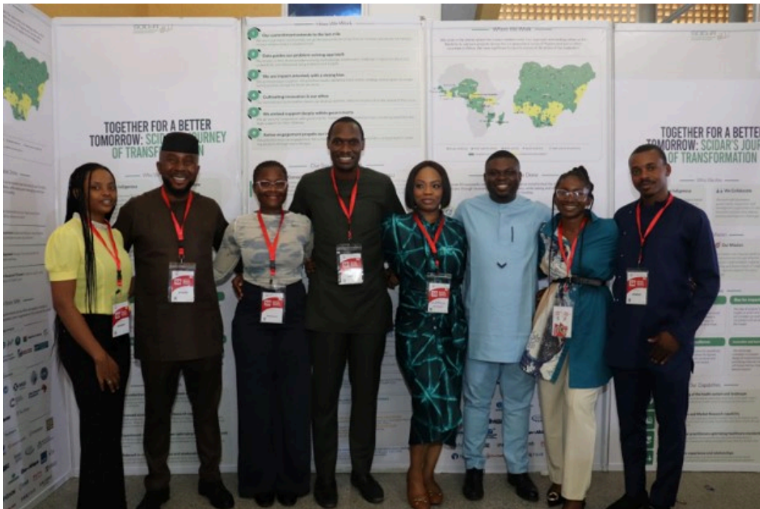
SfM representatives with other SCIDaR representatives at SOGON

The conference was the largest gathering of obstetricians and gynaecologists in Nigeria, with over 500 attendees and stakeholders from a wide range of areas including healthcare and public health practitioners, members from the pharmaceutical industry, and vendors. There was significant participation from NGOs, including SCIDaR, Jhpiego, Nigeria Health Watch, Maternal and Reproductive Health Research Collective (MRHRC), and Centre for Clinical Trials Research and Implementation Science (CCTRIS).