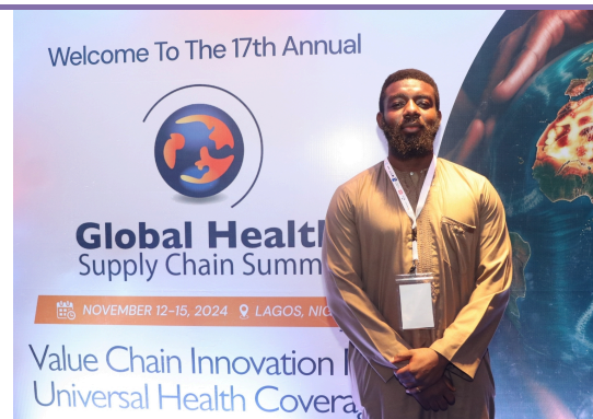
SfM representative at GHSC Summit