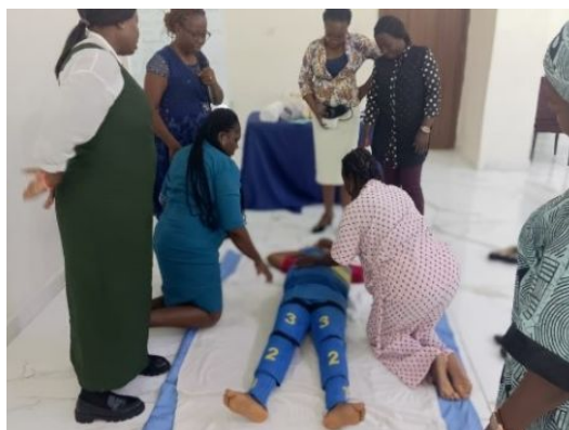
Participants at the training in Lagos State

Between April and May 2025, over 600 healthcare workers across the seven program states participated in a three-day training on improved postpartum hemorrhage (PPH) care, led by the CHAI team. The sessions combined Objective Structured Clinical Examinations (OSCEs), case discussions, practical demonstrations on Active Management of the Third Stage of Labor (AMTSL), use of the non-pneumatic Anti-Shock Garment (NASG), and the E-MOTIVE bundle. The training resulted in marked improvements in both knowledge and clinical skills across all cadres, including doctors, midwives, and community health extension workers.